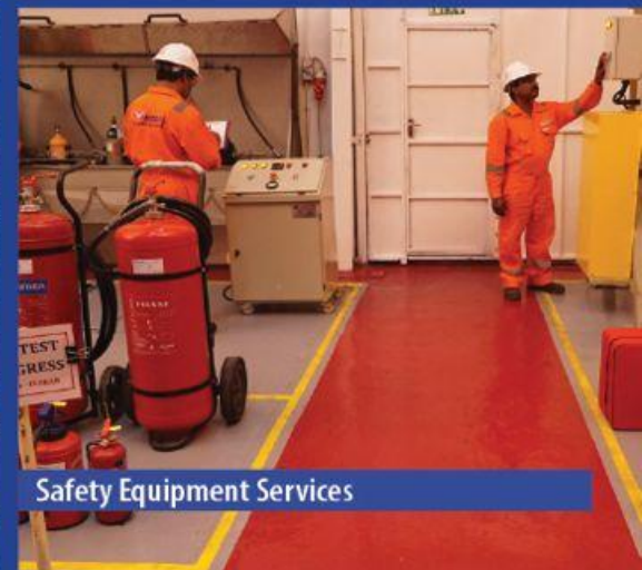
Safety Equipment Services