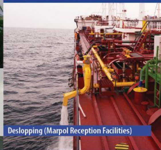
Deslopping (Marpol Reception Facilities)