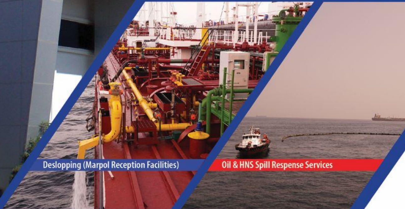
Deslopping (Marpol Reception Facilities)