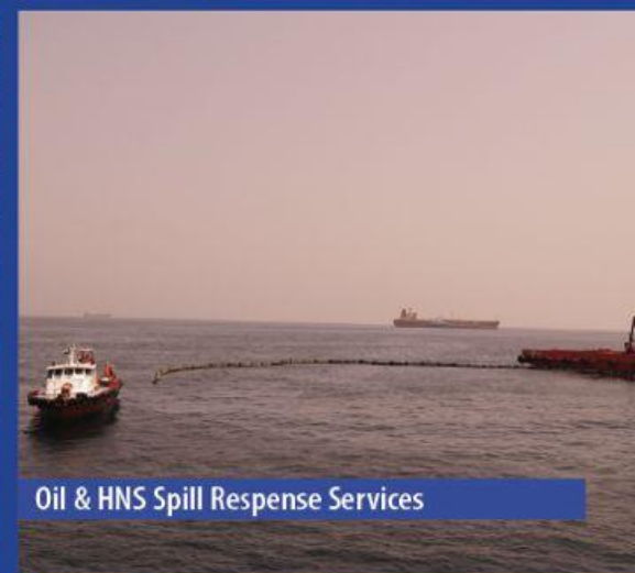
Oil & HNS Spill Response Services