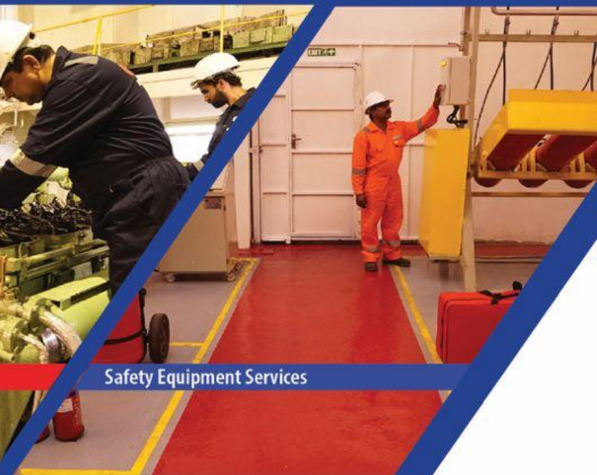
Safety Equipment Services